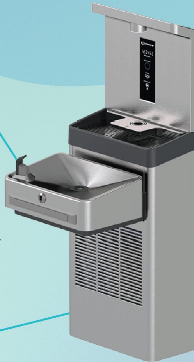
1211SFH model shown