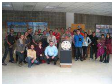
Chicago Deep Tunnel's Mainstream Pumping Station

It was a great opportunity for students and engineers to visit one of the greatest engineering wonders of the world . Special thanks to MWRDGC, Metropolitan Water Reclamation District of Greater Chicago , and ASPE Student Chapter for organizing the tour. ASPE Student Chapter is planning to host another field trip in next spring. If you have any suggestion on the possible tour opportunity, please contact the student chapter: aspe.illinoistech@gmail.com