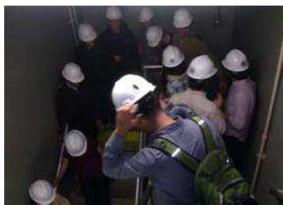
On the way to the pump room 350 feet below ground.