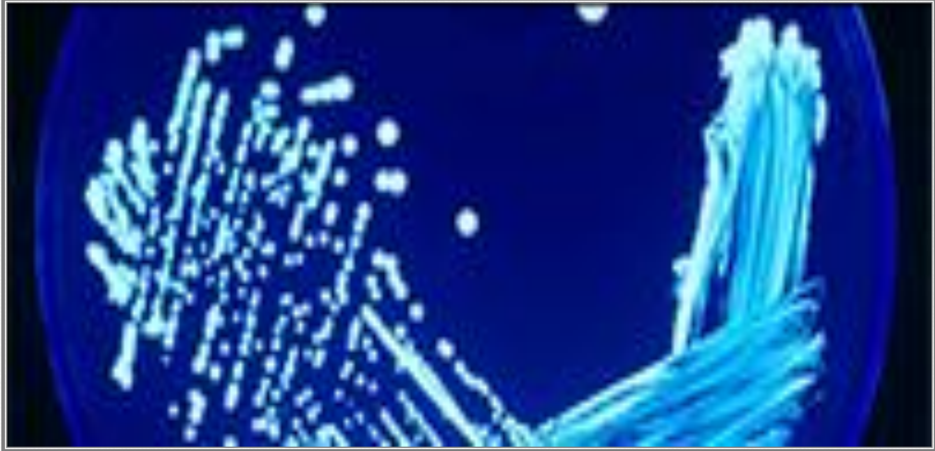
Petrie Dish of Bacteria